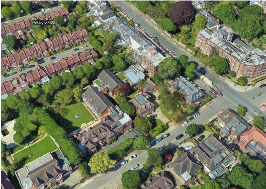
Fig 1 – Aerial View

junction of North Hill and View Road is Weatherley Court, a small modern development of 4 storey houses. To the rear of Weatherley Court and adjacent to the site is 1a View Road, which appears to be a large house on a large plot. Directly opposite the North Hill frontage is the four-storey block of flats 'Highcroft', located at the corner of North Hill and Church Road. The surrounding area is predominantly residential with a diverse range of different architectural styles.