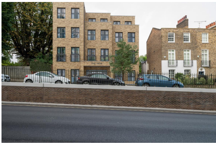
Proposed North Hill Frontage

6.3.13 The Conservation Officer notes that the proposed office building along North Hill retains the proportions of the existing one, which is bland and monolithic and offers a straightforward opportunity for improvement. The proposed design seizes this opportunity to enhance forms, functions, and setting of the listed terrace and introduces an interesting articulation of heights and masses and a facade design inspired by the adjacent Georgian terrace and softened by the elegantly multifaceted brickwork façade. The proposal has been carefully shaped and assessed in views across the conservation area along North Hill and by virtue of its sensitive design approach, it fully respects the architectural primacy and legibility of the listed terrace in its urban context and is supported from conservation grounds.