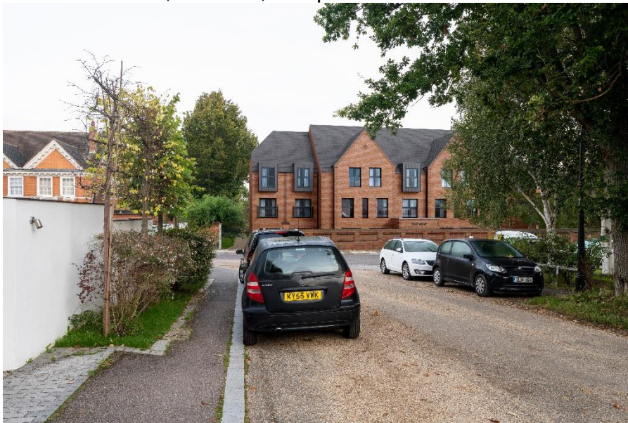
Proposed View Road frontage

contemporary reinterpretation of a suburban villa with symmetric façade, generous fenestration and an interesting roof articulation that draws inspiration from the traditional roofs, dormers, and prominent gables of the adjacent buildings. The subtly elaborated brick façade would be complemented by the soft landscaped garden hidden behind the retained boundary wall located on a raised street level along View Road where the proposed building will positively complement its varied context while retaining a number of established features of this part of the conservation area such as the enclosed nature of the View Road building, the suburban, residential, verdant character of View Road as well as featuring the established architectural forms and materials reinterpreted in a more contemporary key. The building fronting View Road is supported from the conservation perspective with encouragement to further refine the façade treatment, dormers, and porch.